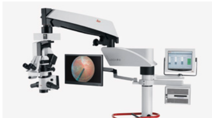
Leica M844 with TrueVision integrated 3D HD visualization system.

TrueVision 3D Heads-up Visualization is available on the Leica M822 and Leica M844 ophthalmic microscopes as an integrated, space-saving package, or as a flexible stand-alone system for many existing microscope models.